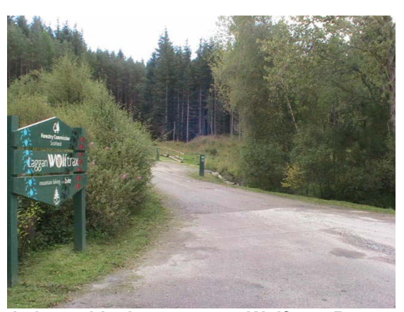
Fig. 5: existing vehicular access to Wolftrax 'Basecamp' area

39. It is likely that the development of additional mountain biking trails and the associated skills area will result in an increase in the number of users of the area, although no information has been submitted to quantify this. In terms of vehicular movements in the area, users of the new bike trails will continue to have the benefit of using the existing 'Basecamp' facilities, including the use of the established entrance from the A86 which has been developed to the standards required by the Trunk Roads division of the Scottish Executive, as well as use of other facilities such as the car parking area and toilet and refreshment facilities. On the basis of the existing level of infrastructure and facilities in the 'Basecamp' area and their shared availability for all users, it is not considered that the increased number of users associated with the new bike trails would give rise to any adverse impacts in terms of general safety in the area.