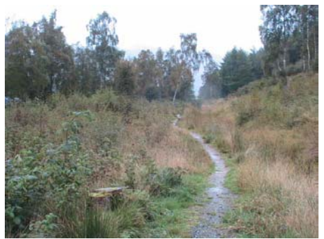
Fig. 2: start of proposed green route

site of the remains of the Newfoundland Overseas Forestry Unit which is considered to be of significance to the cultural heritage of the area, and in the future the route is also intended to form part of a link to further horse trekking trails which Laggan Forest Trust aspire to construct in order to circumnavigate the Laggan Woltrax mountain bike facility.