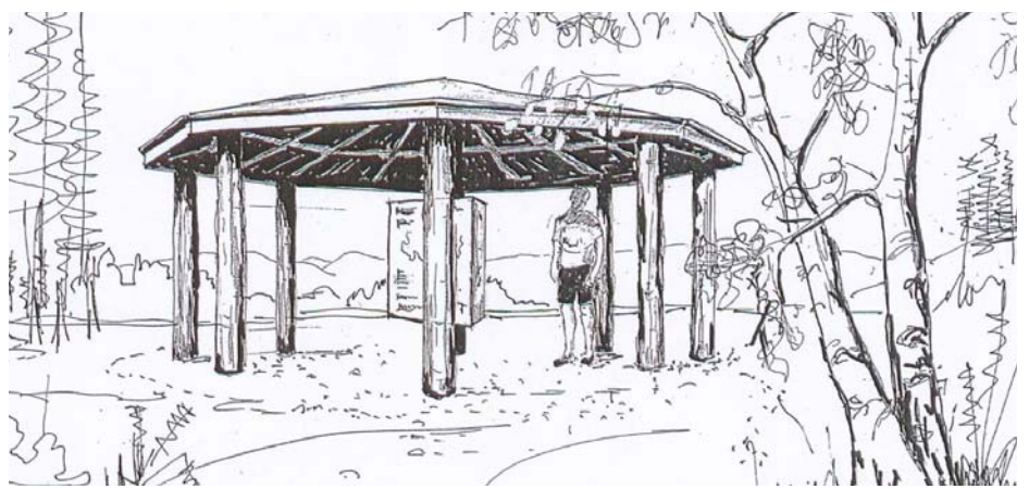
Fig. 4: Proposed cyclists shelter

4. The site of the aforementioned shelter is at the proposed fork of the green grade trail (with the option of travelling northwards towards Gorstean or eastwards towards the proposed new skills area and the remainder of the green grade circular route) in a location which has been clear felled in the past and is now relatively open and visible from the surrounding area. The proposed shelter is a simple open sided structure, with the hexagonal roof having a diameter of 5 metres and consisting of mineralised felt with timber fascia boards. The roof structure is to be supported by larch timber uprights.