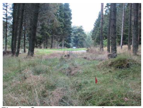
Fig. 3 : Green route emerging at Gorstean

4. The site of the aforementioned shelter is at the proposed fork of the green grade trail (with the option of travelling northwards towards Gorstean or eastwards towards the proposed new skills area and the remainder of the green grade circular route) in a location which has been clear felled in the past and is now relatively open and visible from the surrounding area. The proposed shelter is a simple open sided structure, with the hexagonal roof having a diameter of 5 metres and consisting of mineralised felt with timber fascia boards. The roof structure is to be supported by larch timber uprights.