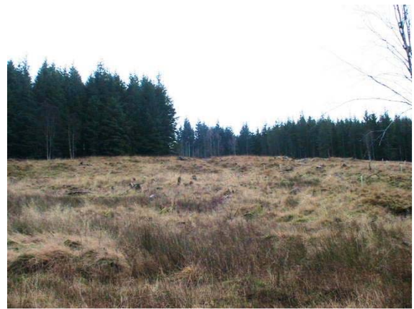
Fig. 5 : Approximate position of skills area and shelter, as viewed from the A86 Trunk Road.

whilst the remainder would be constructed within the adjacent forested area, which is not scheduled for felling until the 2012 – 2016 period.